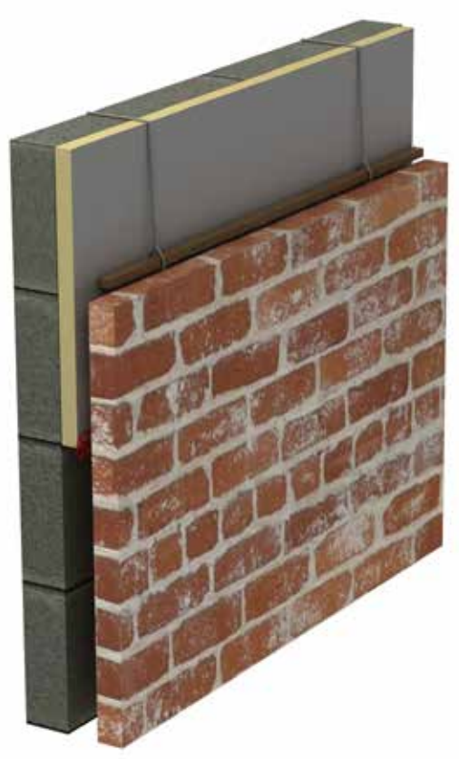
Figure 3 - Use of cavity batten.

The composition and properties of the interior finish are determined by the final use of the building and will closely depend on aesthetic criteria and fire safety requirements. All finishing materials must be according to the manufacturer's specifications.